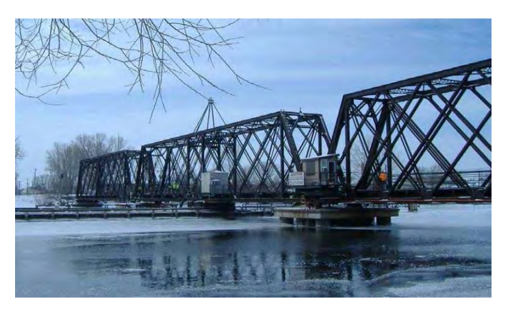
Above, the original crossing in winter. Below, a train goes through the newly completed bridge.