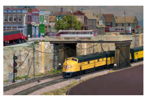
Jim Osborn's beautiful HO CNW Western Division will host both an Op Session and a Layout Tour at RailFun.