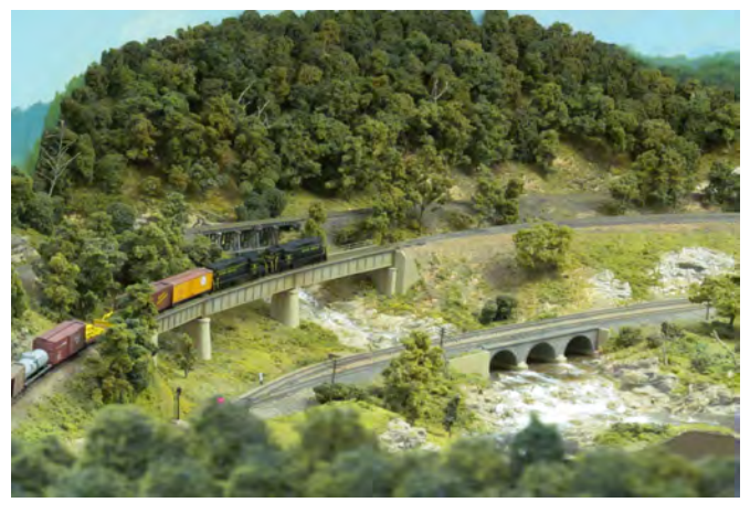
The Reid brothers' famous N scale Cumberland Valley is one Illinois Railway Museum is opening up its shops for us of 30 superb Chicagoland layouts on RailFun Layout Tours.

Here's just some of what will be at RailFun 2014!