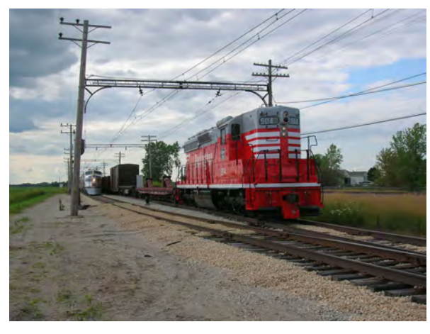
in one of 2 terrific Prototype Tours for RailFun attendees.