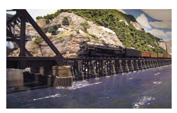
Pete Walton's large Great Midwest HO layout is a scenery and structure lovers delight. It will be on a Friday night RailFun Layout Tour.