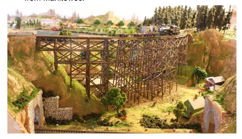
An 1800's era logging camp railroad by Bob Hackl from Manitowoc.

The Midwest Region Convention in Manitowoc is only a few months away. As a preview, here are some photos of home layouts anticipated to be open for tours as part of convention activities. Stay tuned for more in the next issue!