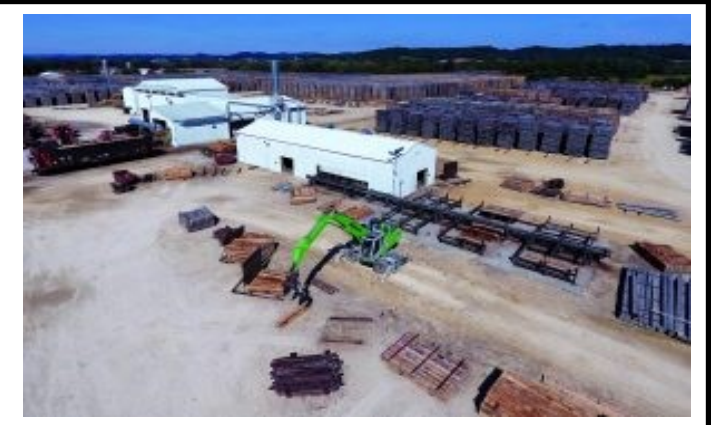
The Stella Jones Railroad Tie Treating facility.

Non-rail events for Saturday include tours of The Shrine of Our Lady of Guadalupe, St. Rose Convent Chapel, The Hixon House, and Riverside Museum. (There will be a small additional charge for these tours.) If time allows, we will also do some shopping at LaCrosse's beautiful downtown. We will return to the hotel for lunch (included in registration cost). These tours will be via car pool!