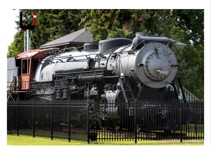
CB&Q 4-8-4 #4000 at Copeland Park.