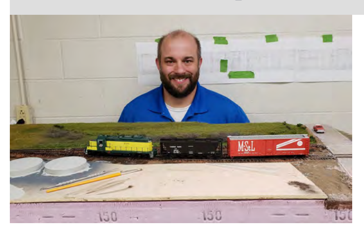
You could say I was born into trains...

Growing up I was exposed to trains every day. My parents' house was located right on the Chicago and Northwestern Marshline Subdivision. Trains would come by two to three times a week, and when the locomotives blew their horns for the grade crossing I'd race out the back door so I could get a glimpse of the slow lumbering locals as they rocked and rolled down the tracks. These first experiences with trains were the gateway for my involvement into model railroading.