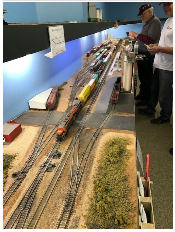
The photo is from the Divisions 2017 Operating session at Joel Weeks Great Northern in 1969 layout. Pictured is a westbound freight preparing to leave the Great Northern's busy Wilmar, MN yard.